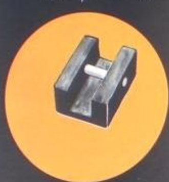
Rear locking mounts

Made of high density material. And they're a snap to use ... just like the original equipment fitting.