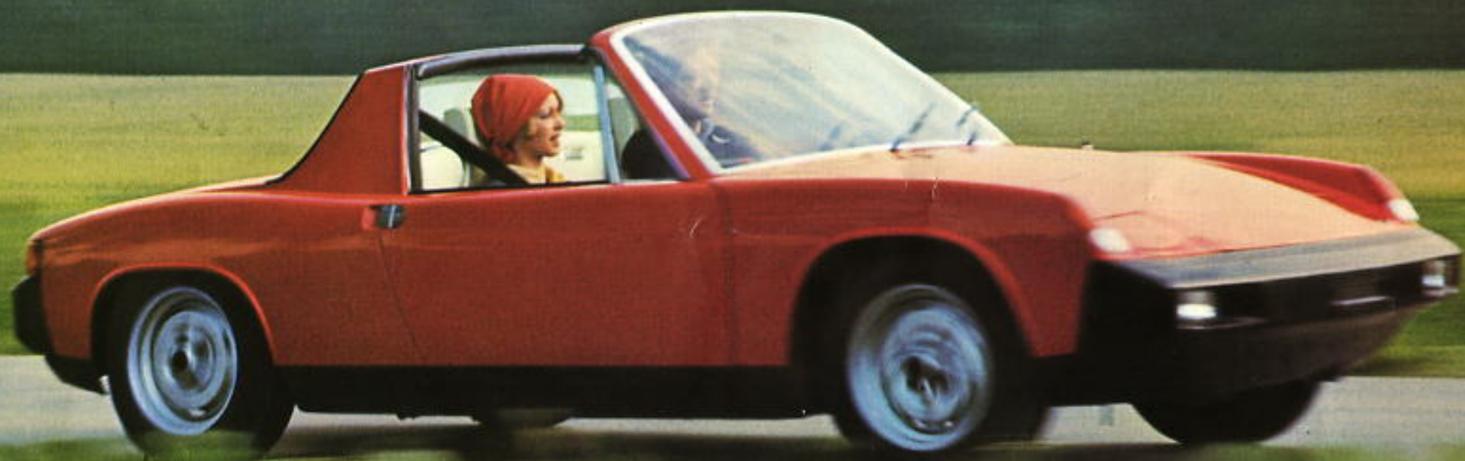
The VW-Porsche 914