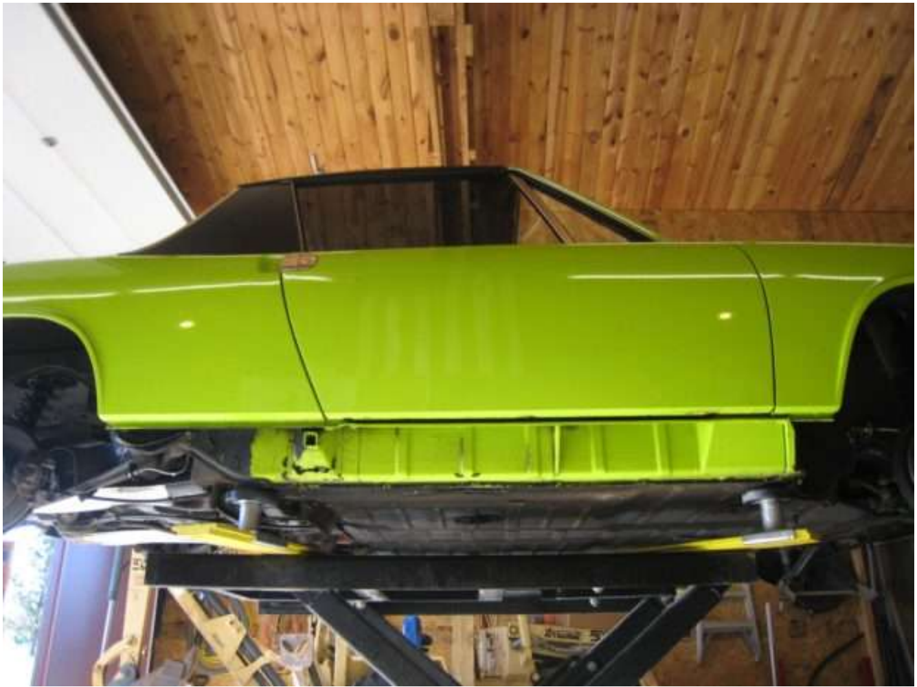
Removal of the rockers reveals clean inner panels, with corrosion limited to the passenger-side jacking point.