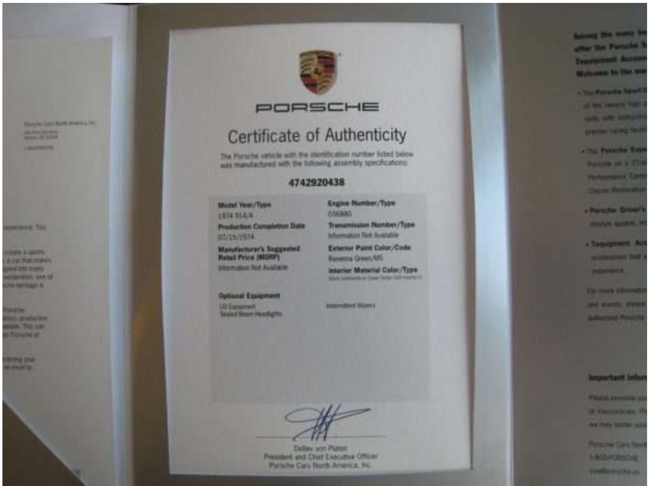
A Porsche Certificate of Authenticity is included in the sale and can be seen above.